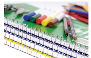
School supplies are needed for the children living at Thornwell Home.